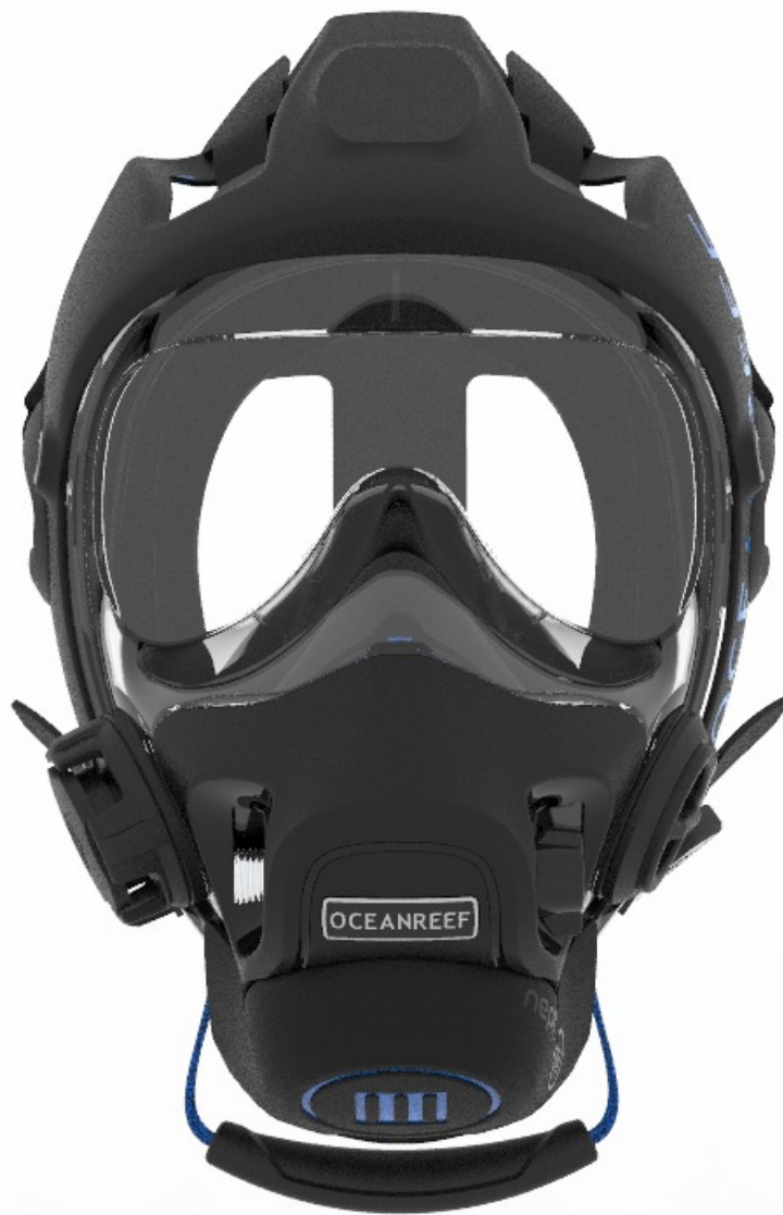
Animation SIZE: visualization of above text.